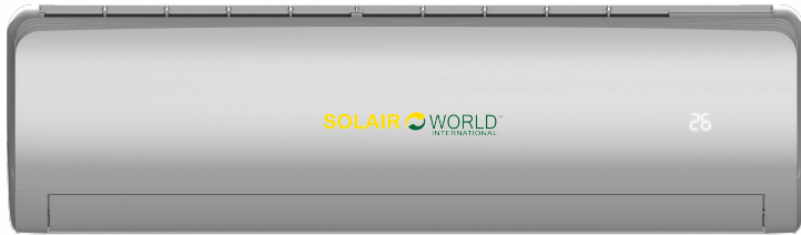
Quiet Indoor Unit (As Low As 26dB)

The SWWR Series is designed from the ground up to operate on DC power. There is no AC power used inside or needed externally to operate the air conditioner.