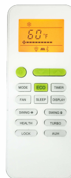
User Friendly Remote w/ sleep mode, timer, & follow-me (C or F)