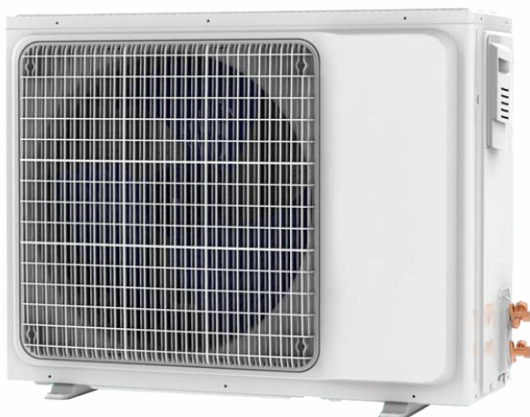
ODU (Outdoor Unit)

48v DC Air Conditioner 4, 6 or 8 x 260w PV Panels PV Mounting Hardware Charge Controller Deep Cycle Batteries Refrigerant Line-set *Customer Supplied Wiring