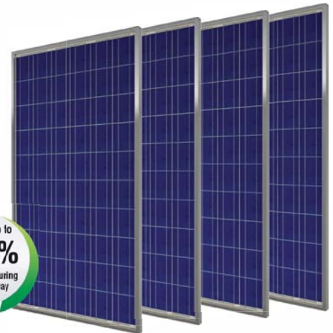
System requires 4 or more solar panels